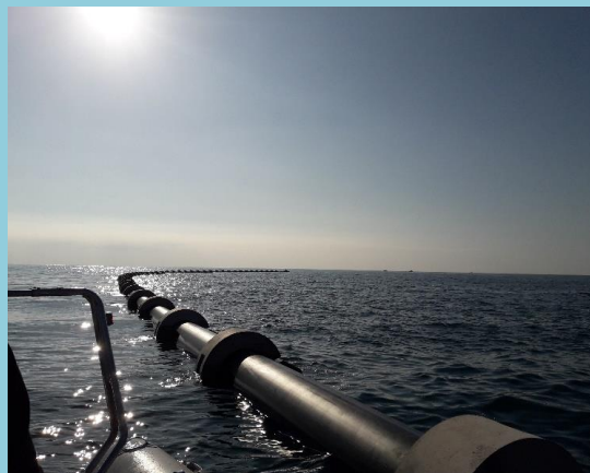
Sea outfall – before immersing

Works are in progress on the PS "Botun", reservoir "Susanj 2", secondary sewer main in Bjelisi, sea outfall "Sutomore", secondary sewer main in Canj, main coastal sewer main in Sutomore (Promenade Ivo Novakovic), secondary sewer main in the northeast of Sutomore. Total value of the works carried out from October to December is Euro 652.284.